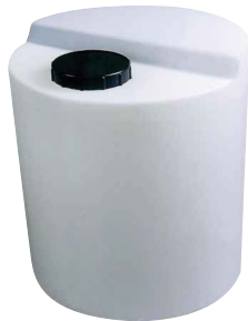
Polyethylene tanks SER Series